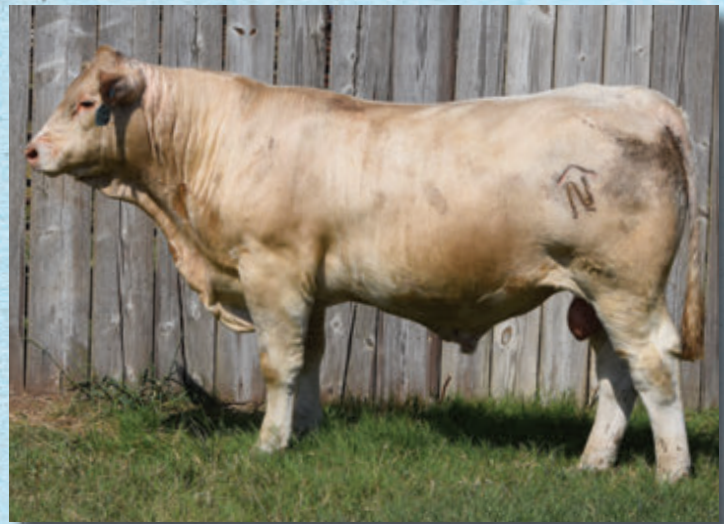
45 | NC/MW 1723 LEDGE 3103