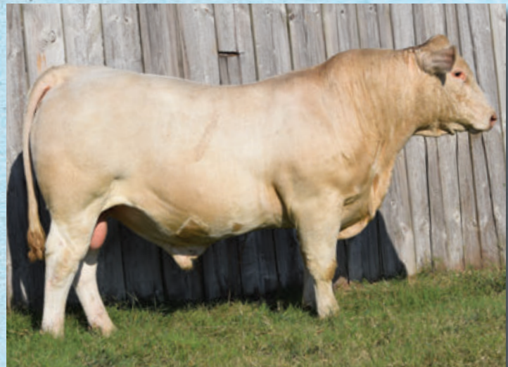
13 | NC HUSTLE 3049P