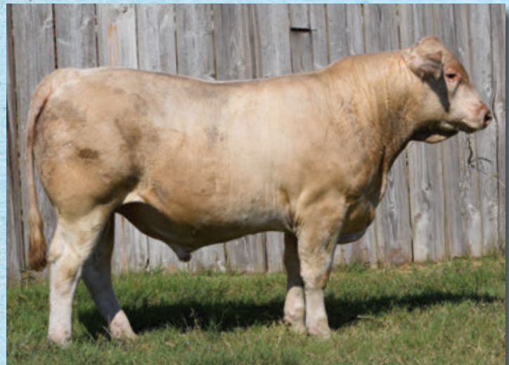
61 | NC UNO MAS 3828P