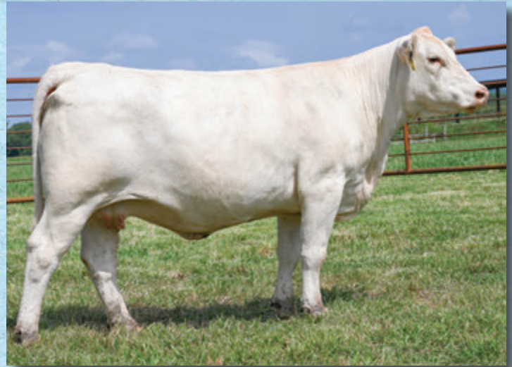
115 | MW MISS SPICE 1019

Due early fall to Southern Ledger 1886F ET EM925794.