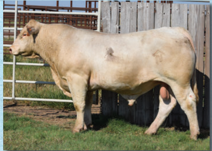
15 | NC MR SMOKIN JOE 7043P