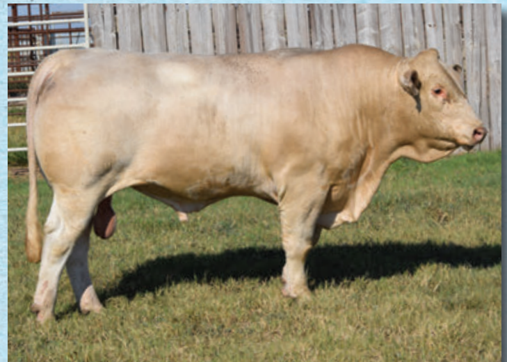
6 | P5 JOSE'S 702