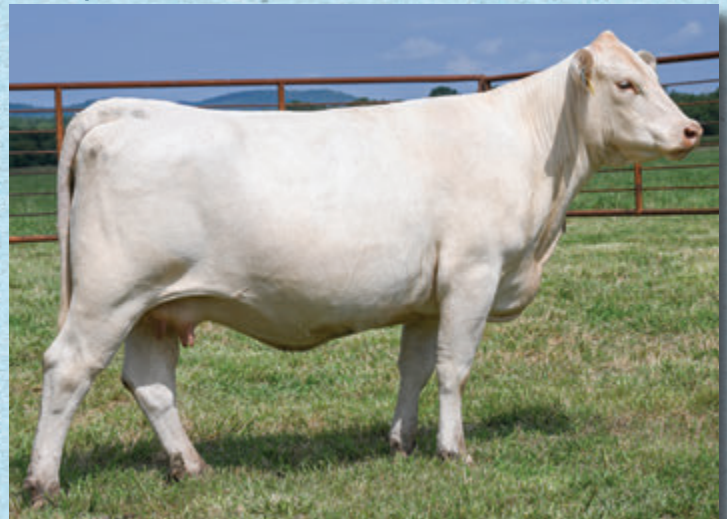
117 | MW WENDY 1090

Due early fall to Southern Ledger 1886F ET EM925794.