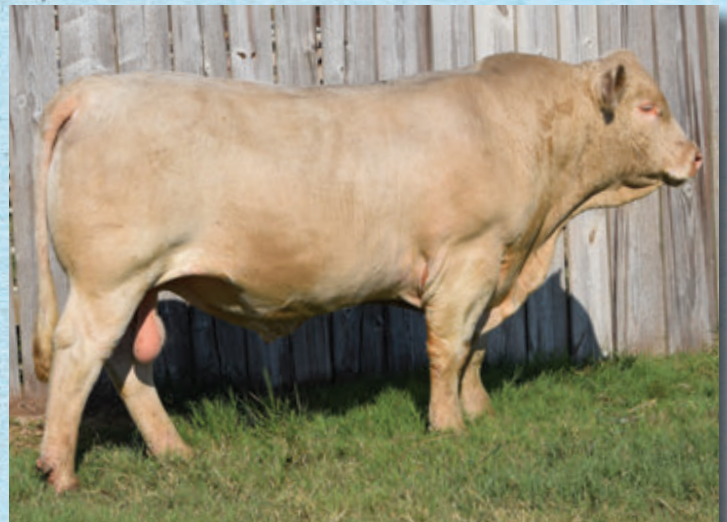
2 | NC TOUCHÉ 3036P