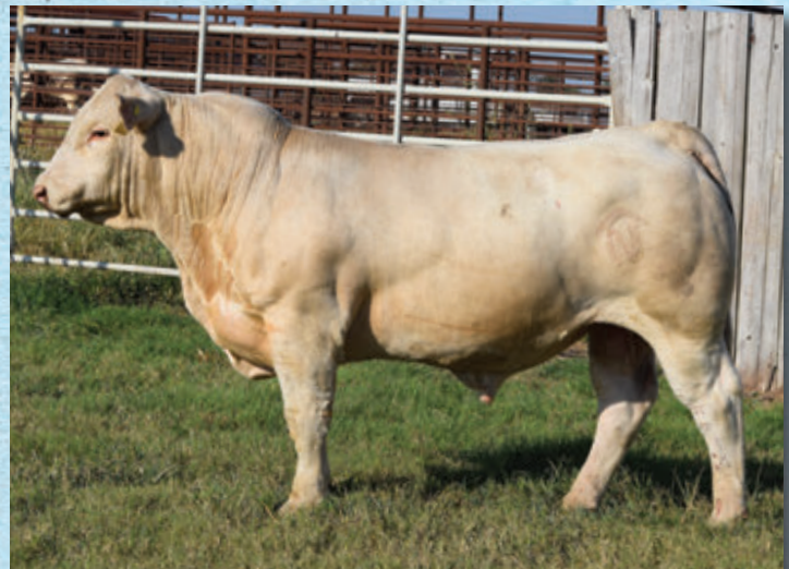
37 | NC HUSTLE 3031P