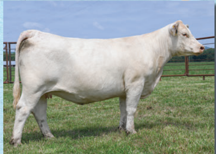
110 | MW ABBIGAIL 1040

Due early fall to Southern Ledger 1886F ET EM925794.