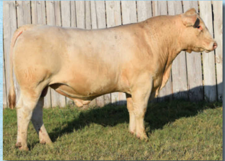
39 | NC GOLD BUCKLE 3042P

Top CE 25%, YW 15%, Milk 15%, MCE 15%, MWWT 15%, SC 25%