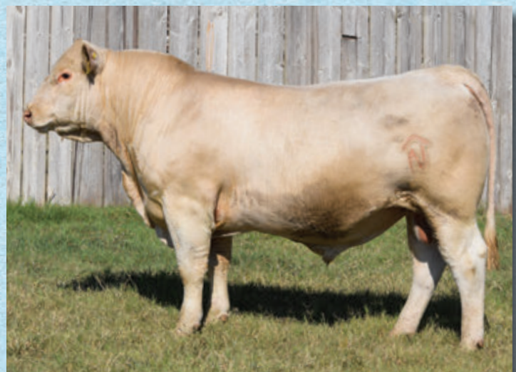
46 | NC HUSTLE 3950P