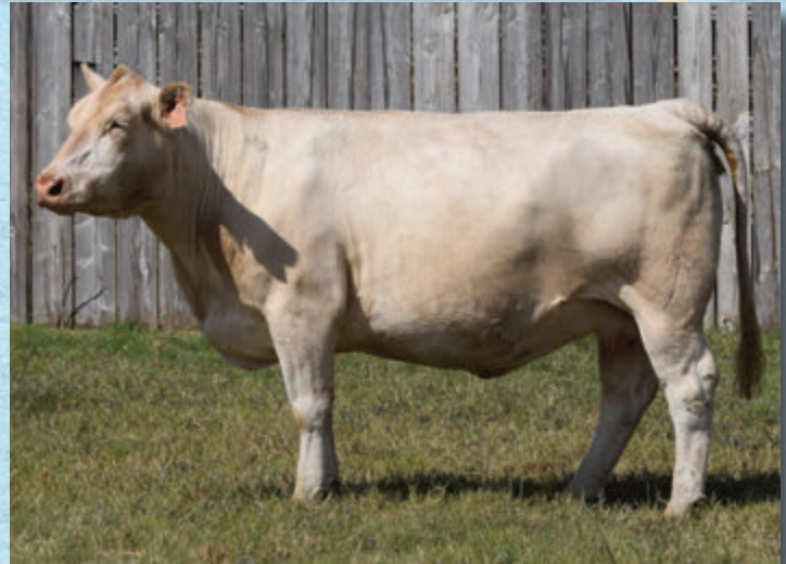
92 | NC LADY EASE F801P

Hard to make them any more correct than this one. Pretty fronted and balanced from front to back. Pedigree says it all. 3141 was the great bull @ EZB Farms in Tennessee and 2170 was the full sister to SR/NC Field Rep. Through both are gone their progeny lives on in our herd and others. Bred to CR/NC Uno Mas 3560 E10 P ET EM919966 for fall calf.