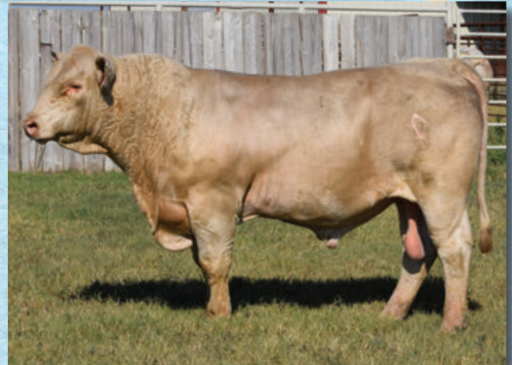
5 | CCF/NC MR SOLUTION 2307

Top CE 20%, WW 2%, YW 2%, Milk 1%, MWWT 1%, SC 10%, Udder 20%, Teat 20%