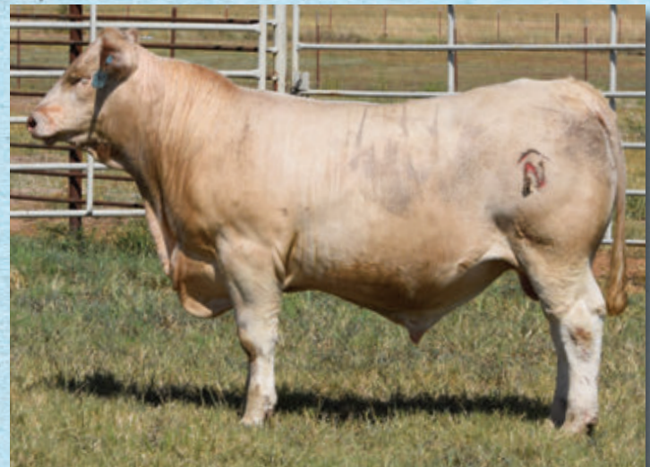
64 | NC/MW 1723 LEDGE 3119