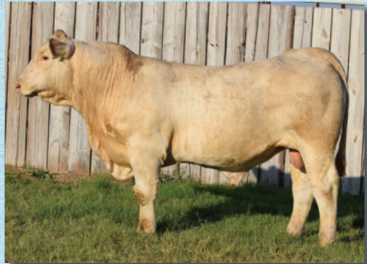
21 | NC TOUCHÉ 3922