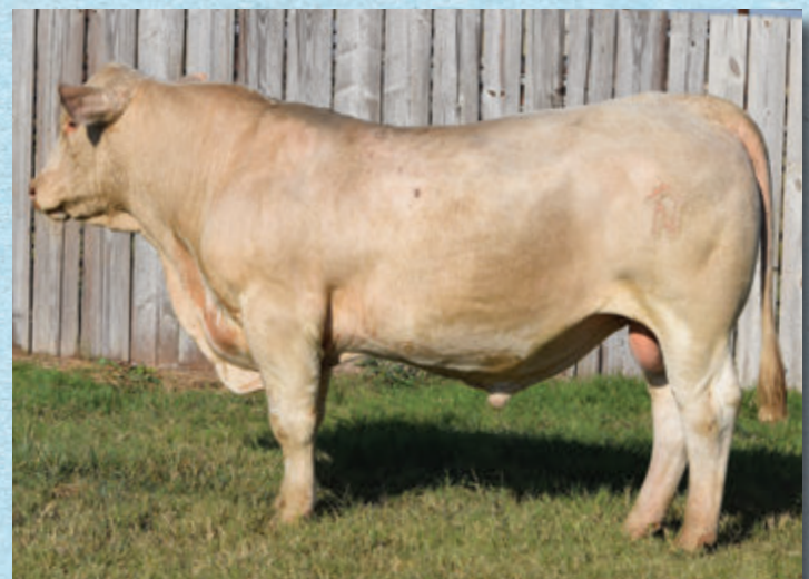
31 | NC/MW SMOKIN JOE 3029