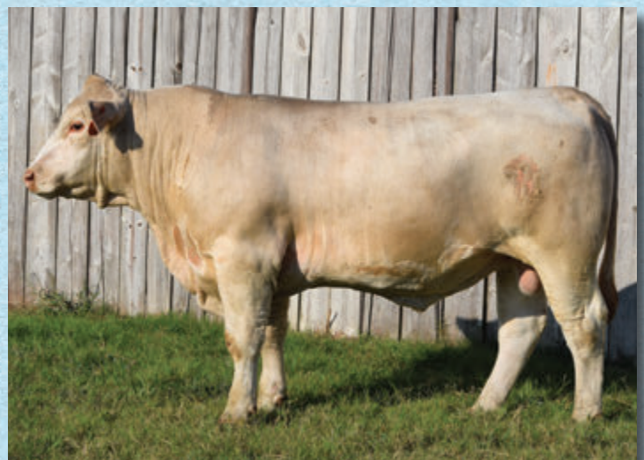
10 | NC/MW HUNTSMAN 3020