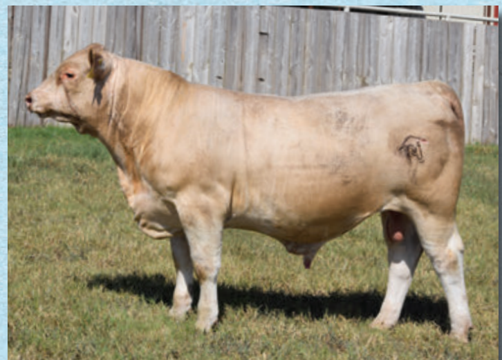
65 | NC UNO MAS 3182P