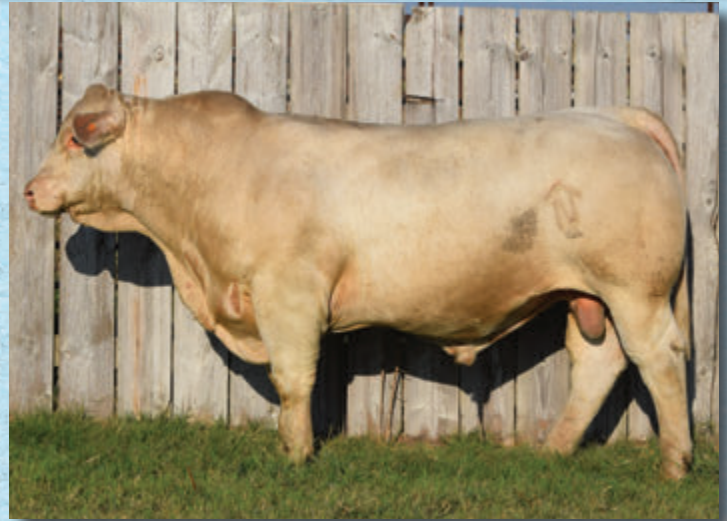
1 | NC MR SMOKIN JOE 8023P