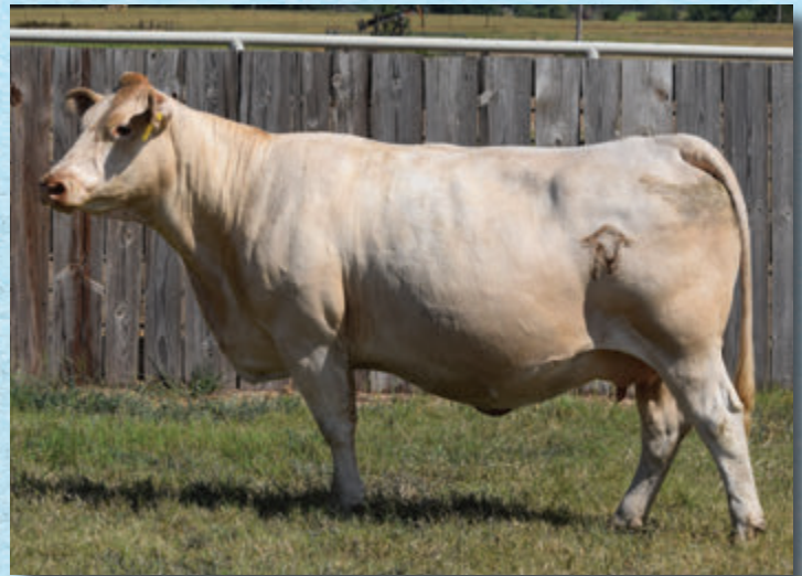
100 | NC GABBIE 871

Top CE 25%, WW 20%, YW 20%, Milk 15%, MCE 15%, MWWT 10%, SC 25% Slightly moderate framed. Really square made with a great udder. Bred to NC Gold Buckle 0103 P M999428 for fall calf.