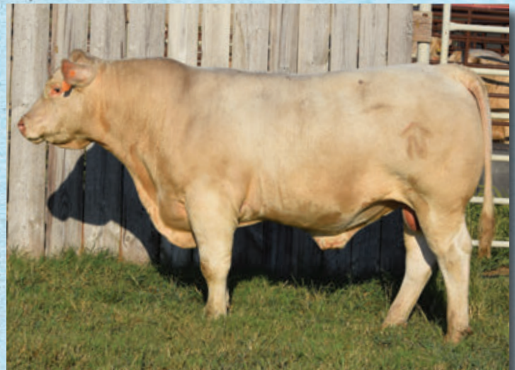
24 | NC MR SMOKIN JOE 7013H