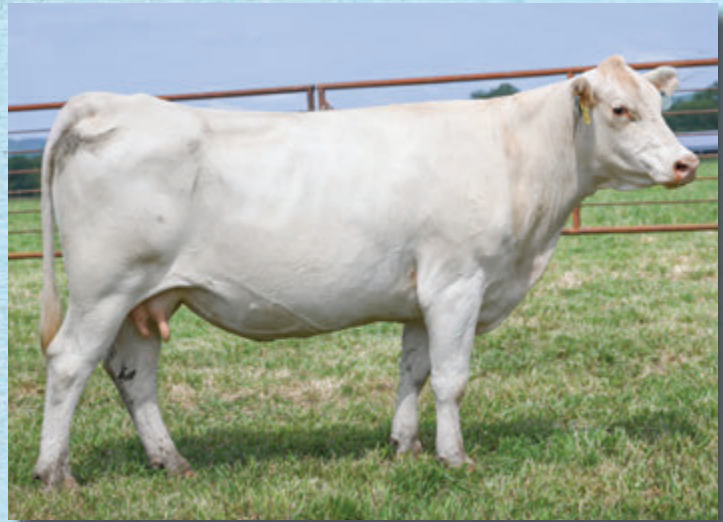
73 | MW ROSA 1030

Heifer Calf born 8/10/24 by Southern Ledger 1886F ET M992256. 77# BW