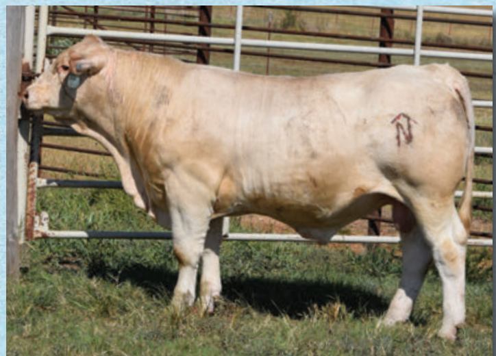
62 | NC/MW ONCE MORE 3124