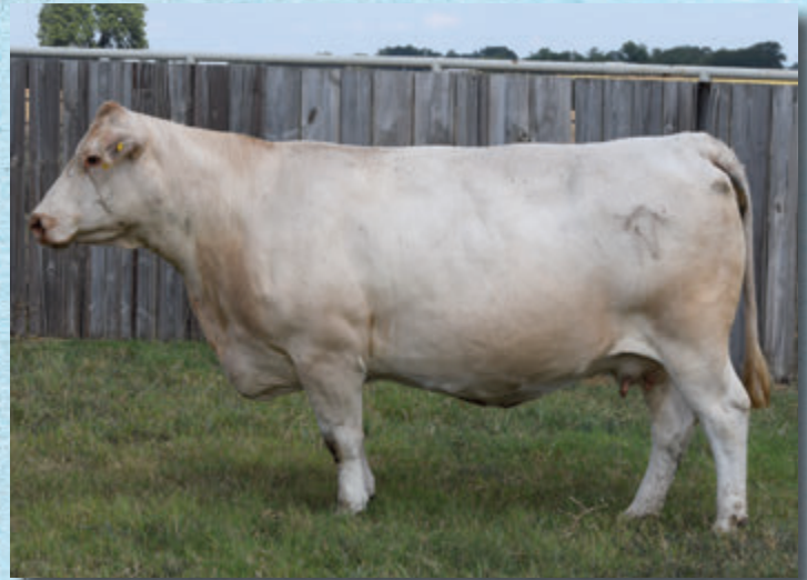
98 | NC CAROLINA 856 P

Moderate framed with loads of thickness and assed structure perfection to go with it. Bred to NC Gold Buckle 0103 P M999428 for fall calf.