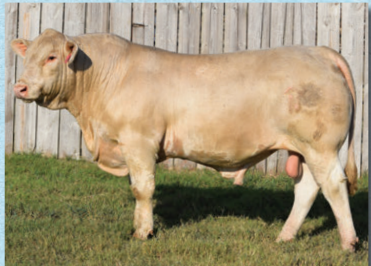
22 | CCF/NC BAIN'S SOLUTION 2314