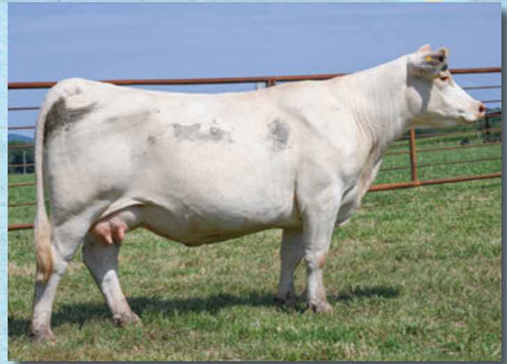
75 | MW ROSA 1042

Heifer calf born 8/9/24 by Southern Ledger 1886F ET M992256. 73# BW