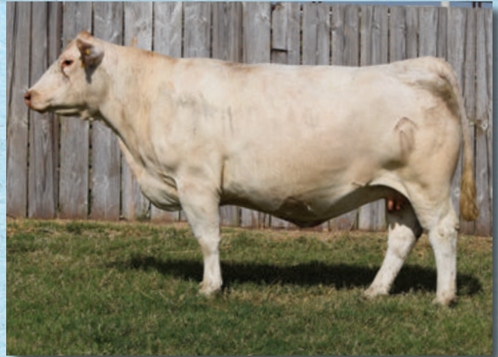
97 | NC JILL 872 P

Super Thick with a perfect udder. Front pasture female for sure. Bred to CR/NC Uno Mas 3560 E10 P ET EM919966 for fall calf.