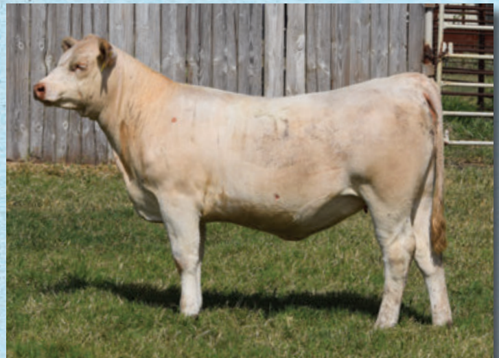
122 | NC GERMAINE'S CLARICE 335P

Open Heifer. Pretty fronted, feminine head and perfect profile besides being out of one of our top cows.