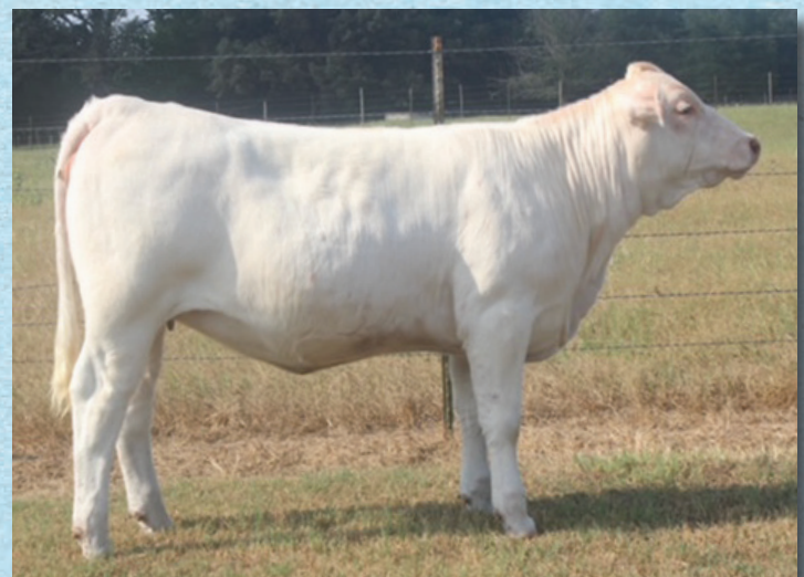
82A | 4N MS BUFFY 328 PLD