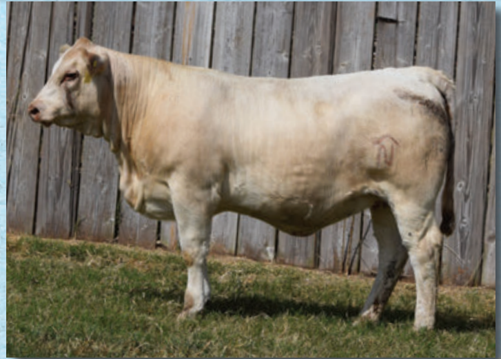
121 | NC BELLE 3440P

Open Heifer. Extremely deep sided and square hipped. Maternal values abound in her pedigree and appearance.