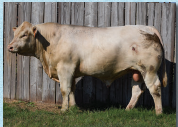
7 | NC MR SMOKIN JOE 18023P