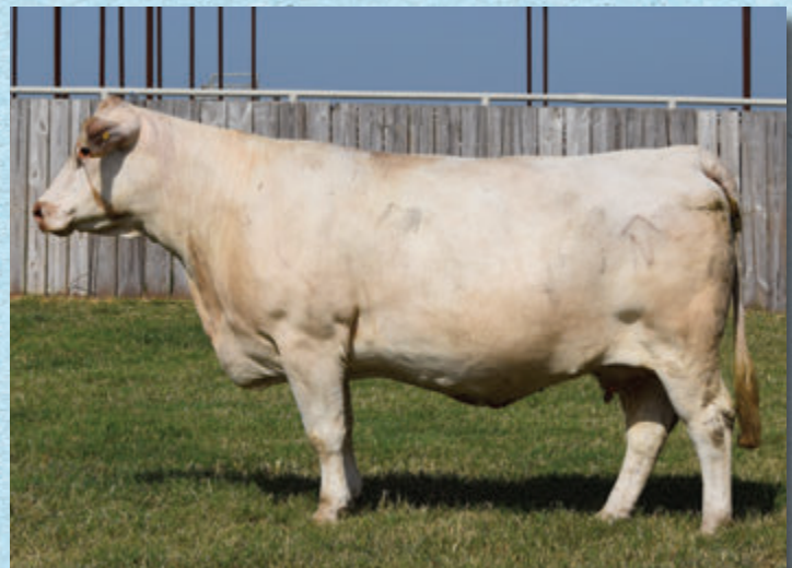
84 | NC MISS BAYLEE F183 PET

Top Milk 20%, MCE 20%, MWWT 20% An easy on the eye correct structures female to include a picture perfect udder. Her 2023 bull calf sells as lot # 65. Bred to CR/NC Uno Mas 3560 E10 P ET EM919966 for fall calf.