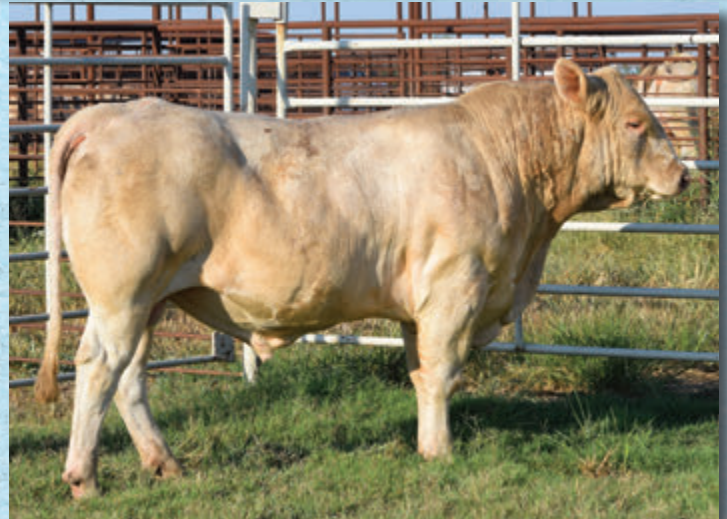
8 | NC HUSTLE 3910P

Top WW 7%, YW 4%, Milk 2%, MWWT 1%, SC 25%