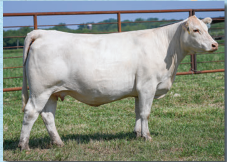
118 | MW GEORGIA 1110

Top CE 15%, BW 25%, MCE 25%, SC 4% Due early fall to Southern Ledger 1886F ET EM925794.