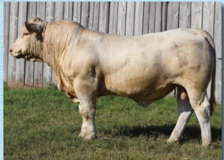
16 | NC/MW SMOKIN JOE 3032