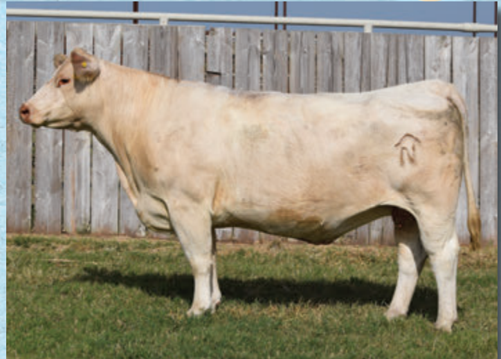
83 | NC CASH DOLL 852 P

Truly a front pasture cow and quite likely a donor prospect. Lots of extension through her front with an extremely feminine head. Lots of thickness and perfect udder and structure combine to make this one really complete. Bred to CR/NC Uno Mas 3560 E10 P ET EM919966 for fall calf.