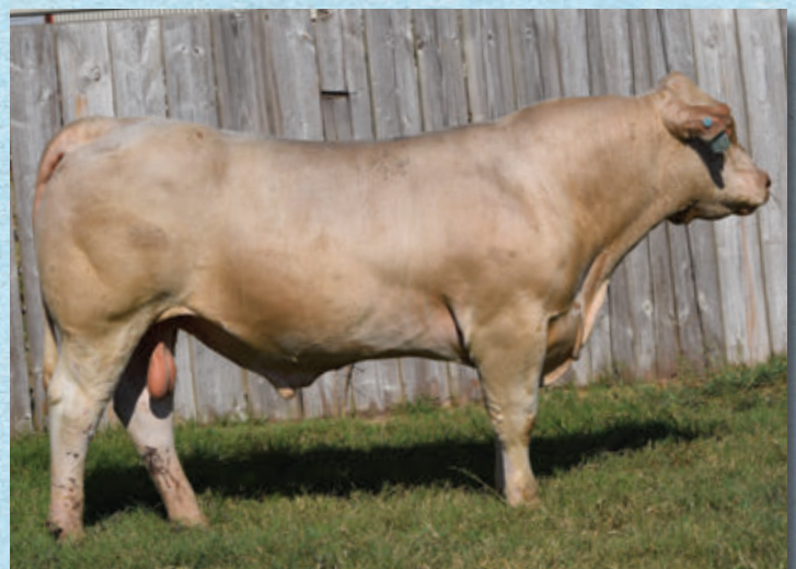
35 | NC/MW CASANOVA 3040