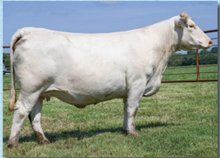
116 | MW MOLLY 933

Due early fall to Southern Ledger 1886F ET EM925794.