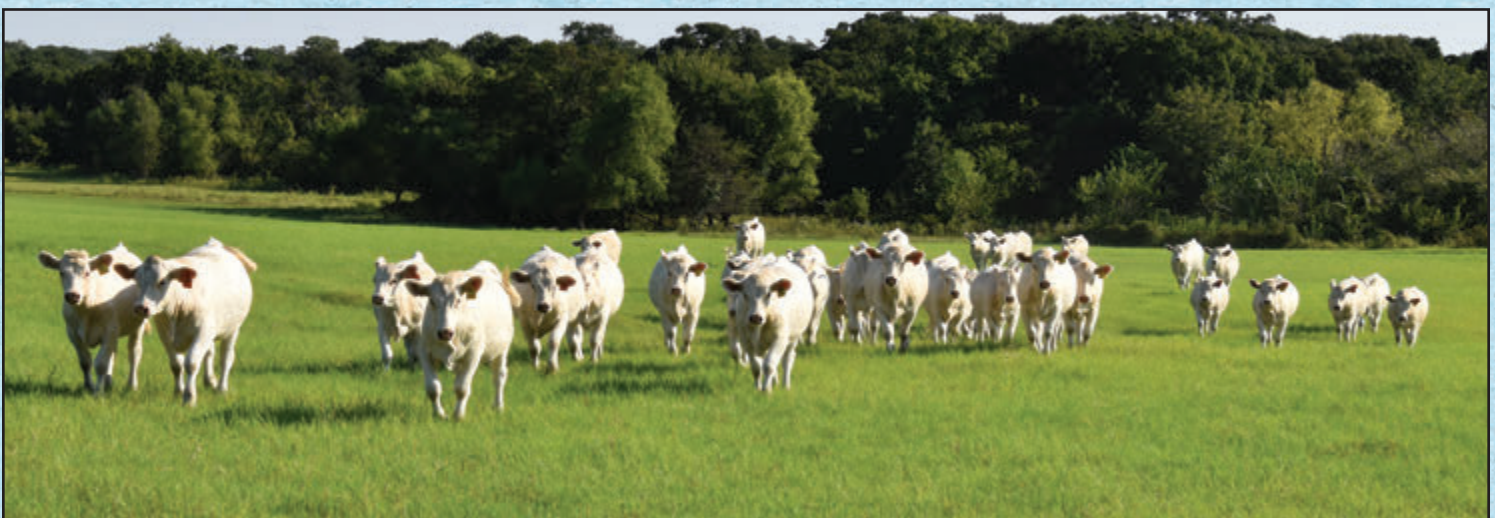
Spring calving bred heifers at Nipp Charolais.