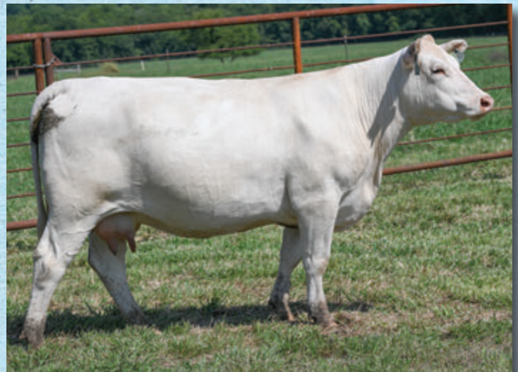
119 | MW DISTANT AIR 1091

Top WW 20%, YW 25%, MCE 20% Due early fall to Southern Ledger 1886F ET EM925794.