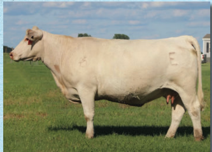
82 | EC BUFFY 941 PLD

For sure a Donor Cow to look at. Both cow and calf have been 100K tested and PA free. Cow is bred to Keys Powermax 57G due 11/27/25. If she has a bull calf we will retain ¼ semen interest for in herd use. We will also retain 1 flush in the cow.